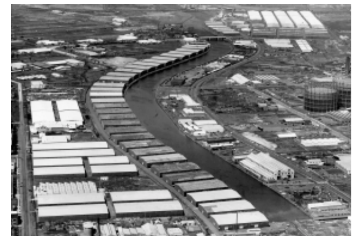
Alexandra Canal c.1942

The Masterplan recognises the rapidly changing landuse patterns in South Sydney and provides the opportunity to discuss and respond to them in a planned, knowledgeable and exciting way. The Masterplan helps to identify all the large and small opportunities that the Canal corridor offers to become the focus of a dynamic community and the final missing piece in a regional green corridor.