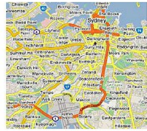
Map 1 - Concept Map available on Bikely at http://www.bikely.com/maps/bike-path/Sydney-Green-Ring